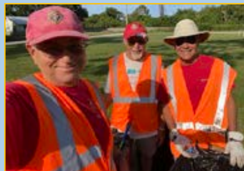
Highway Clean Up — We Need More Help