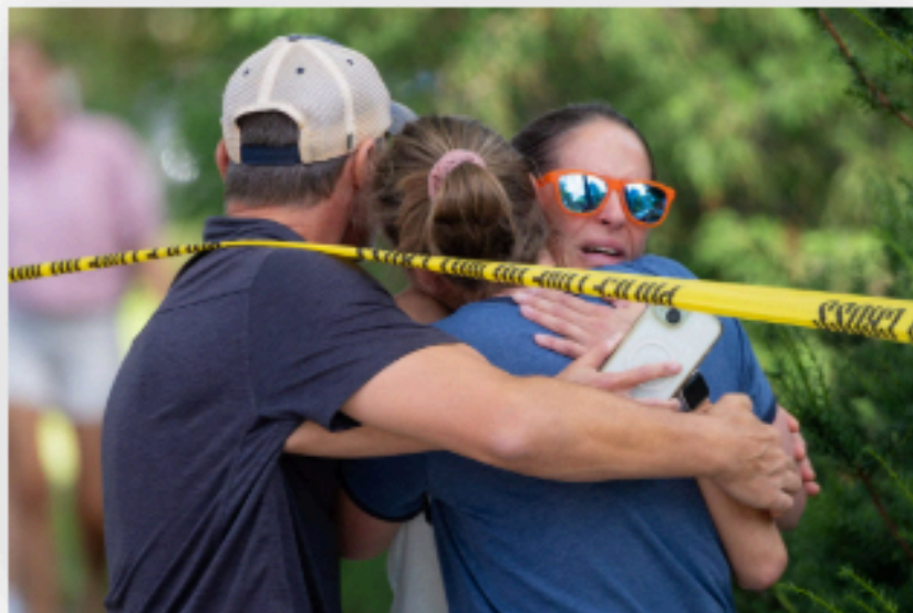
Families and loved reunite following a shooting at Annunciation Catholic School in Minneapolis Aug. 27, 2025. The Richfield Police Department is reporting there are up to 20 victims and the shooter is dead.